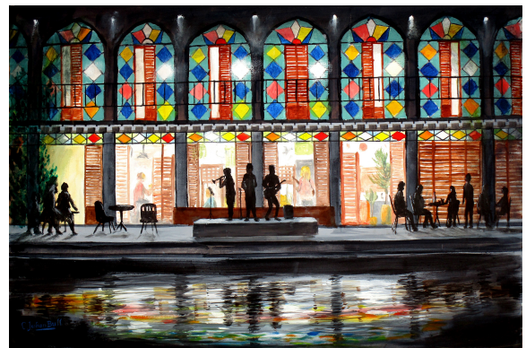
Los Jasmines Hotel, Cuba