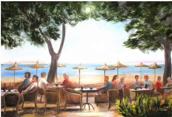
Coffee on the Pinewalk, Mallorca

Art to me is a journey; an exploration of many different avenues; never getting stuck on the same track too long. This way the experience always remains fresh and exciting. That is why I have called this exhibition of my work 'Explorations'.